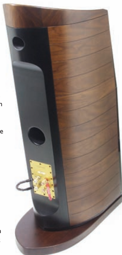
recorded last week, rather

Likewise, cue up Saxon's '747: Strangers in the Night' and the Be-10s cut right through the mix, conveying Barnsley's finest with sparkling clarity and freshness that makes the music sound like it was